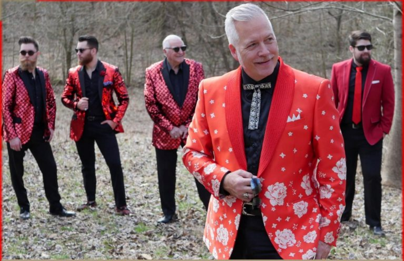
Tomorrow's Bluegrass Stars