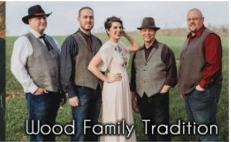
Wood Family Tradition